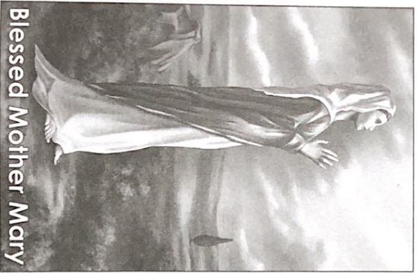
Blessed Mother Mary